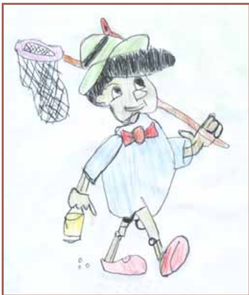
This is my drawing of Pinocchio. The quiz is at the top of the next column.

Pinocchio was written in the eighteen hundreds.