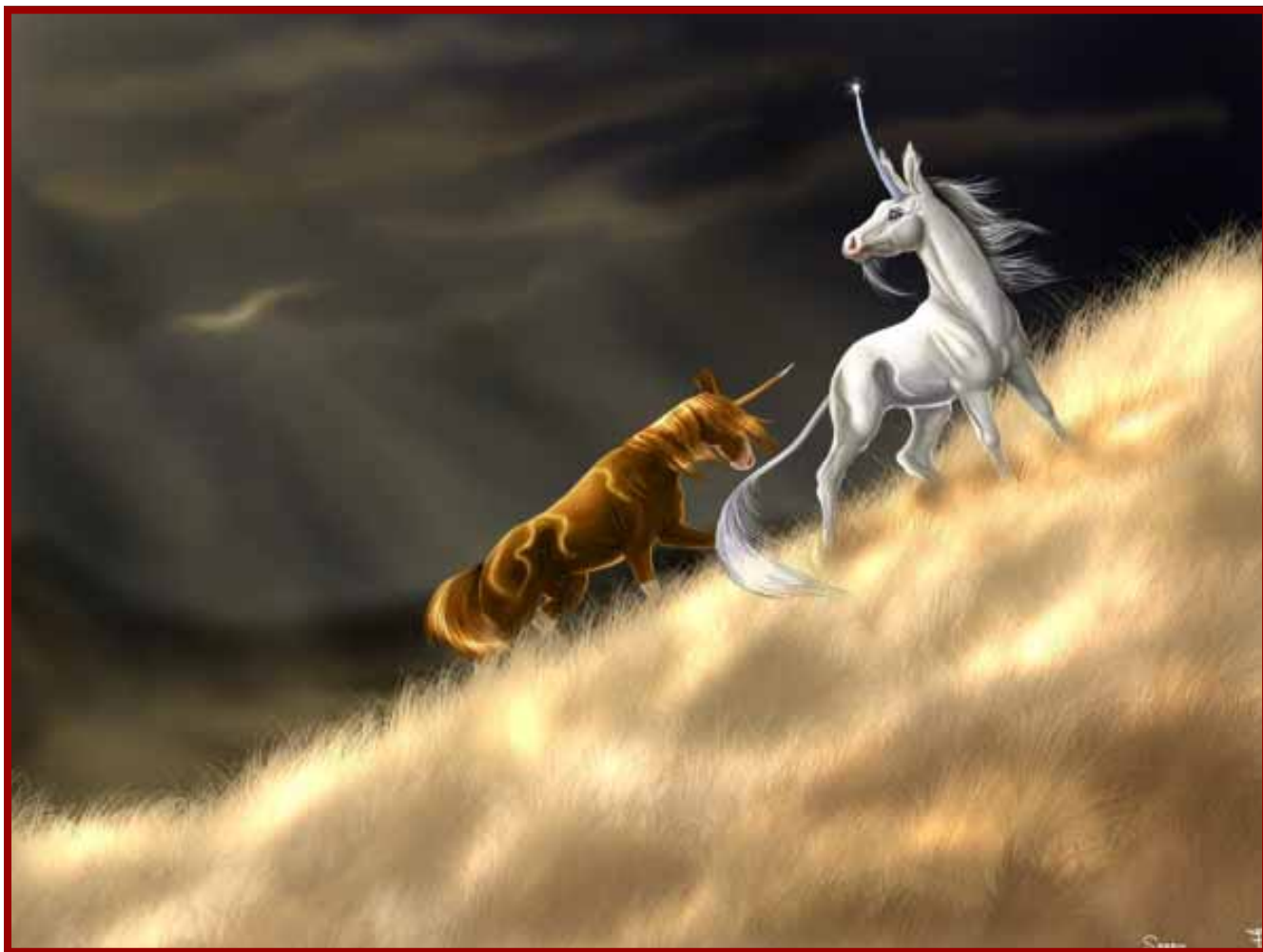
The picture called 'Flight' was painted by Sarah in Adobe Photoshop CS3 with a WACOM Intuos 3, and took about 10 hours to complete. The characters in it are Kleidopious, the chestnut horse, and the Antichrist, the white unicorn, and they're in the Lands of

The Central Regional Health School is located at: