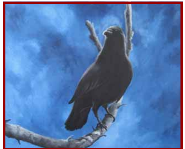
By Sarah 'The Winter Crow.' It's acrylic on canvas and took maybe 3 hours to paint. There's no meaning behind it. I just wanted to paint a crow.